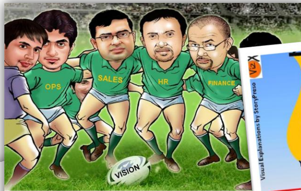
Some PowerPoint slides